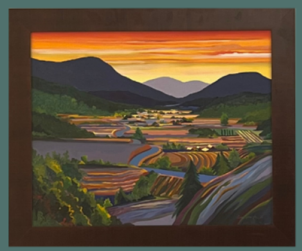
Brasstown Valley Looking West at Sunset